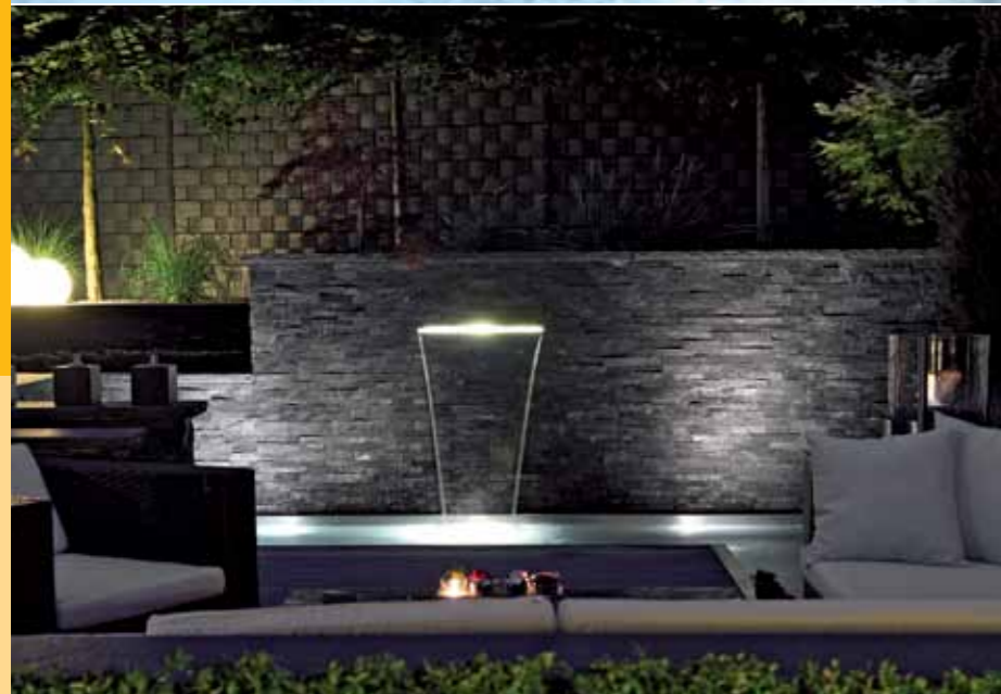
The waterfall illumination emphasises the contours of the water pattern and ensures atmospheric lighting